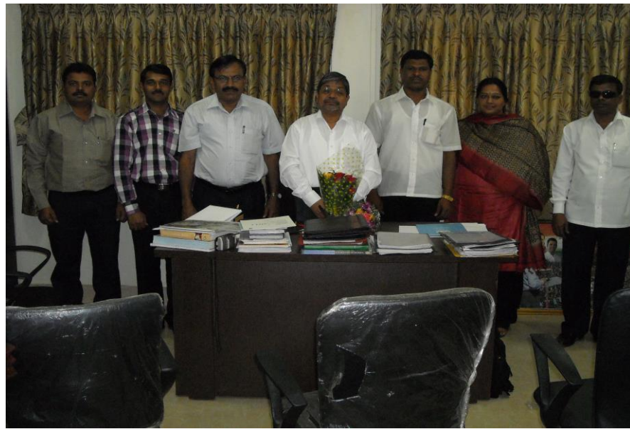
Fonder Members of “Konkan Arthshyastra Parishad”