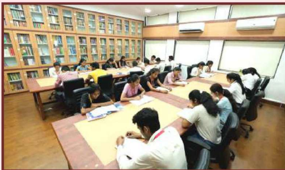
Library Reading Space