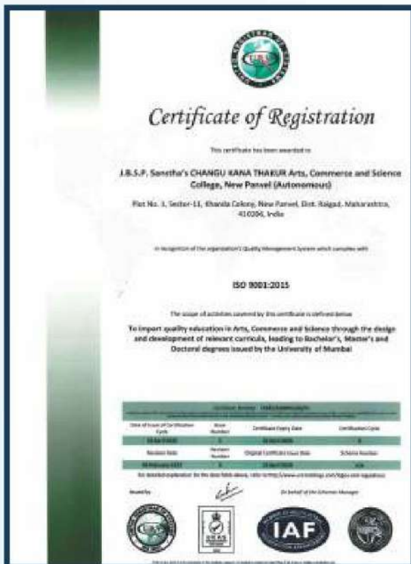
ISO 9001 : 2015 (Quality Management System) (2022-2023 to 2024-2025)