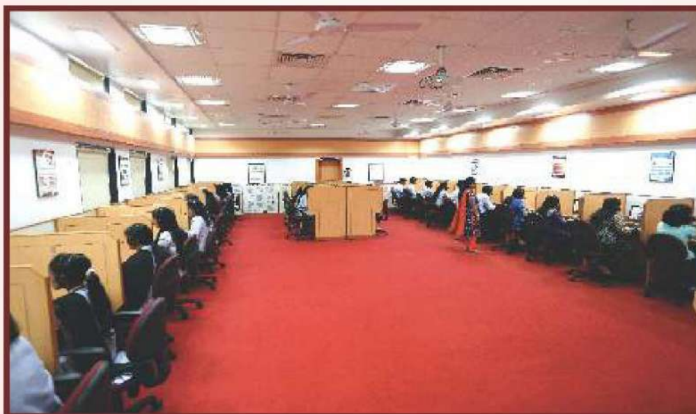
Interactive Language Laboratory