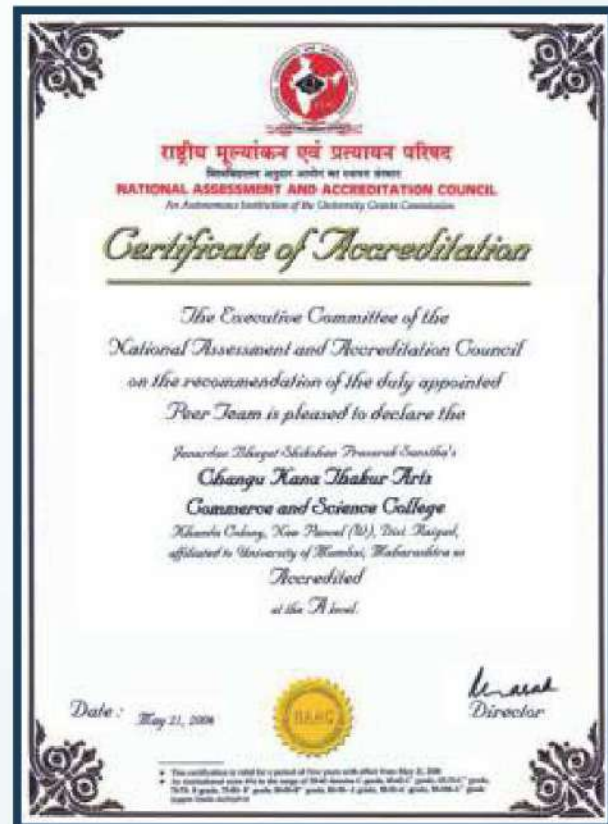
Accredited 'A' Grade by NAAC (2005-2006 to 2010-2011)