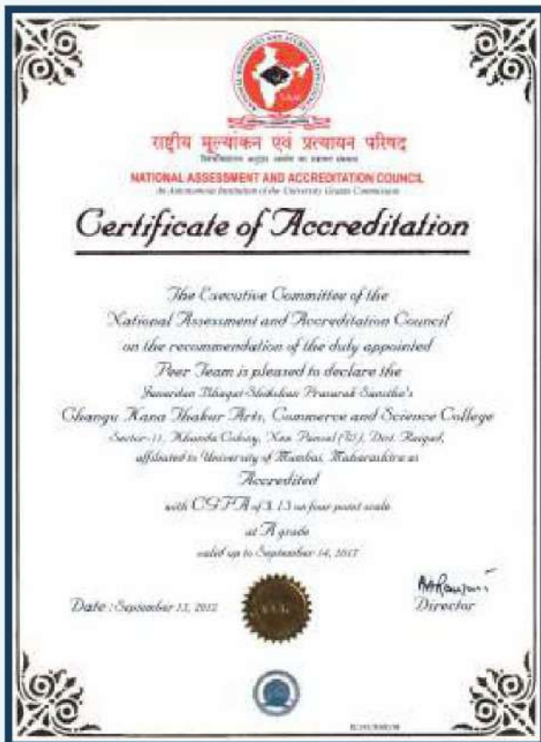
Re-accredited 'A' Grade by NAAC (2012-2013 to 2017-2018)