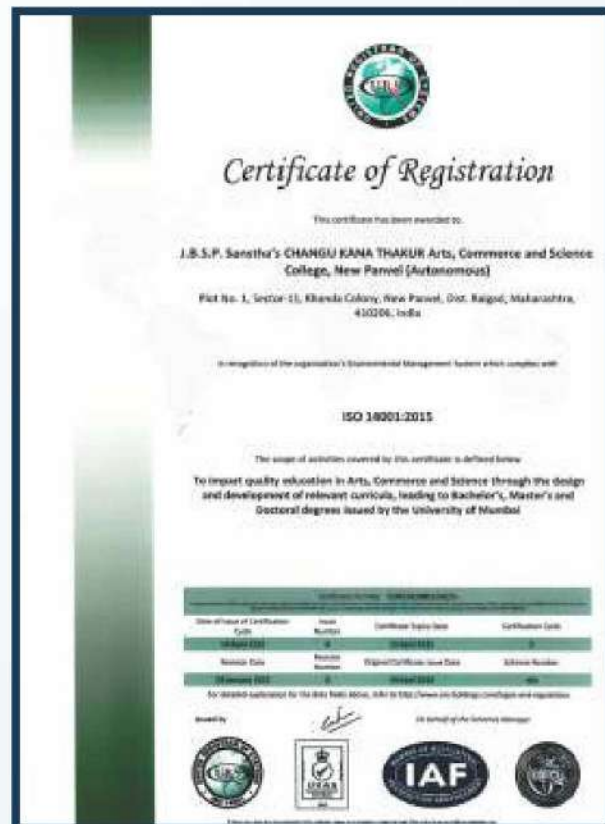
ISO 14001:2015 (Environmental Management System) (2022-2023 to 2024-2025)