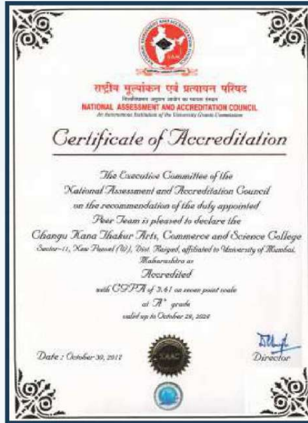
Re-accredited 'A+' Grade by NAAC (3rd Cycle - CGPA3.61) (2017-2018 to 2024-2025)