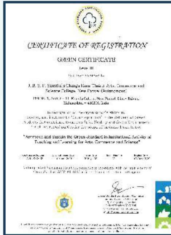
Green Certificate (2022-2023 to 2024-2025)