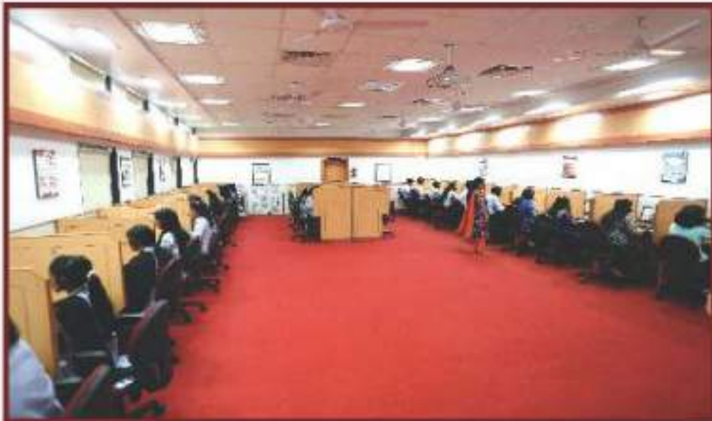
Interactive Language Laboratory