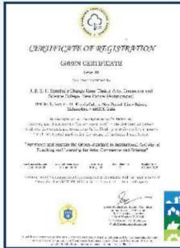
Green Certificate (2022-2023 to 2024-2025)