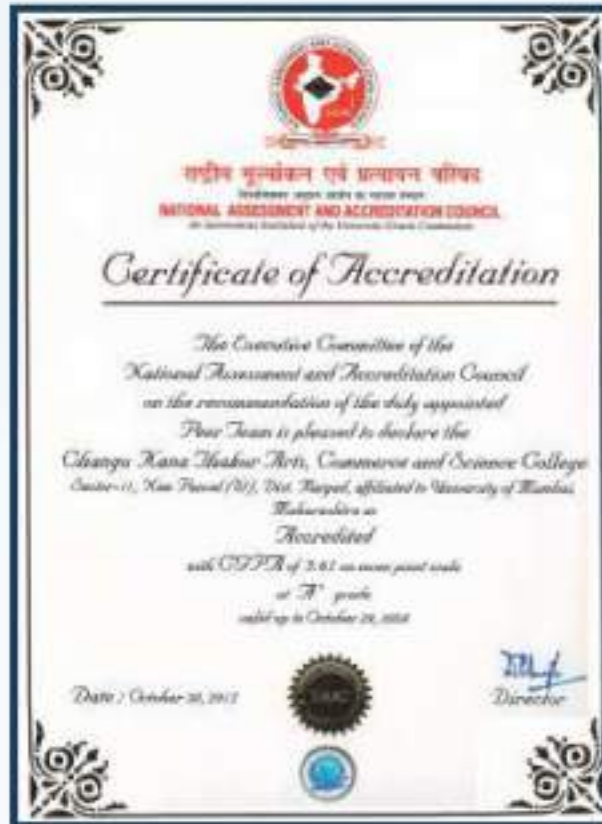
Re-accredited 'A+' Grade by NAAC (3rd Cycle - CGPA3.61) (2017-2018 to 2024-2025)