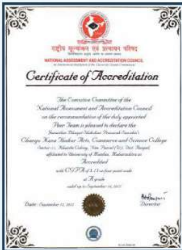
Re-accredited 'A' Grade by NAAC (2012-2013 to 2017-2018)