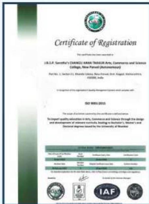
ISO 9001 : 2015 (Quality Management System) (2022-2023 to 2024-2025)