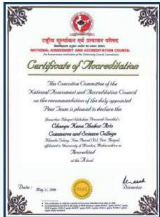
Accredited 'A' Grade by NAAC (2005-2006 to 2010-2011)