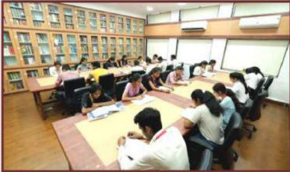
Library Reading Space