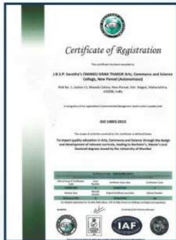
ISO 14001:2015 (Environment Management System) (2022-2023 to 2024-2025)